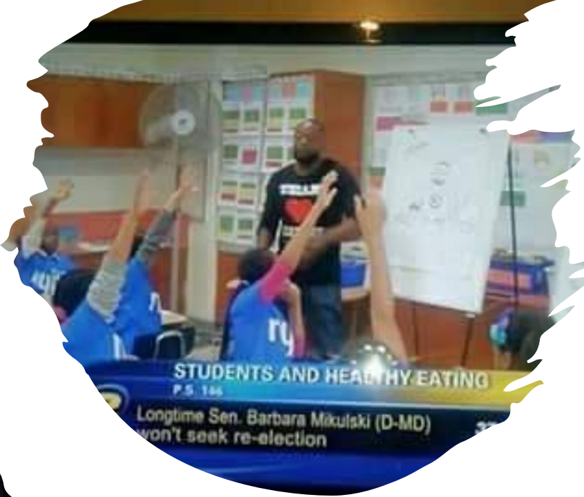
Workshops and Seminars: FRESCH is more than just a meal program; it's a social movement. We don't just fill bellies; we educate and empower. We host workshops and seminars to teach Bronx communities how to embrace healthier eating habits.