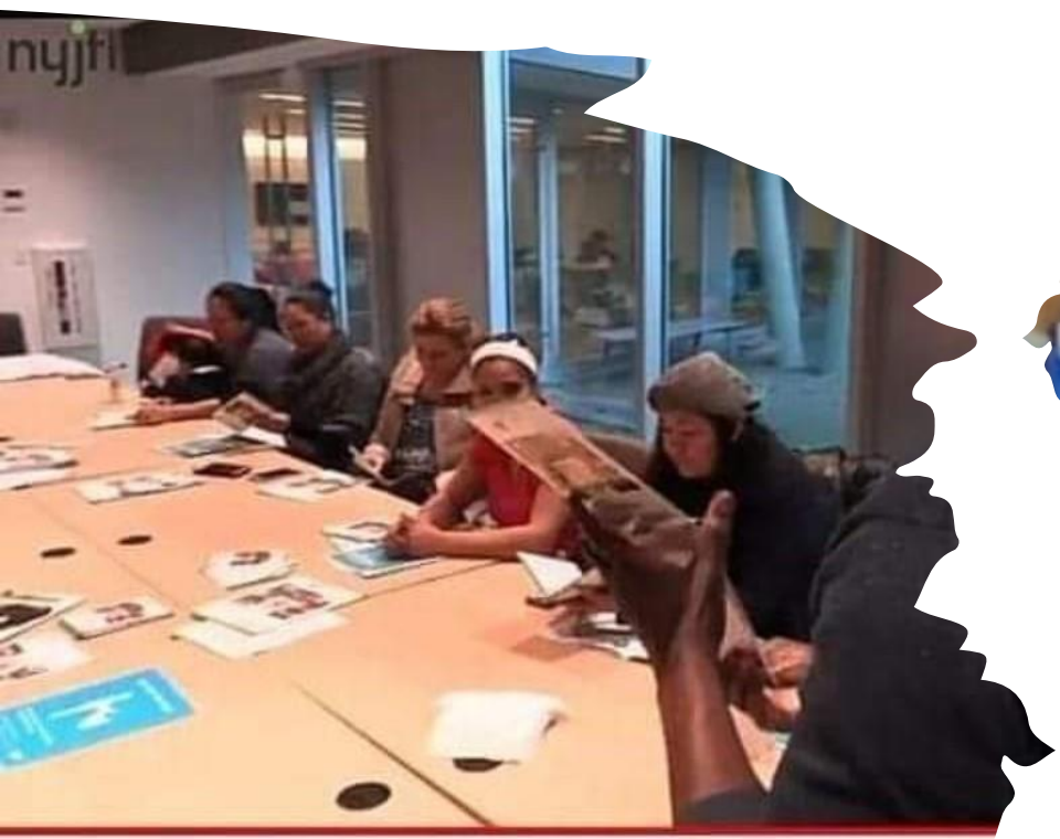
Family and Community Engagement Series (FACES) at the Cary